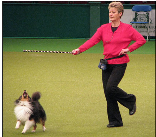
There is no end to the activity and fun of Crufts!