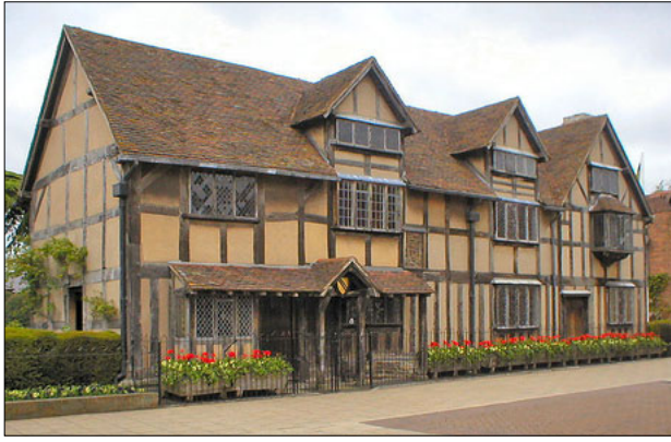
Stratford, the birthplace of Shakespeare